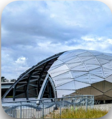
The Hydroneess scheme benefited from the Scottish Recycling Fund.

Impact: since launch, loans have been issued to more than 20,000 energy efficiency