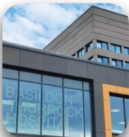
Mid and South Essex NHS Foundation Trust, a PSDS beneficiary.

Ambition: to continue delivering successful projects through all phases of these schemes and launching new waves.