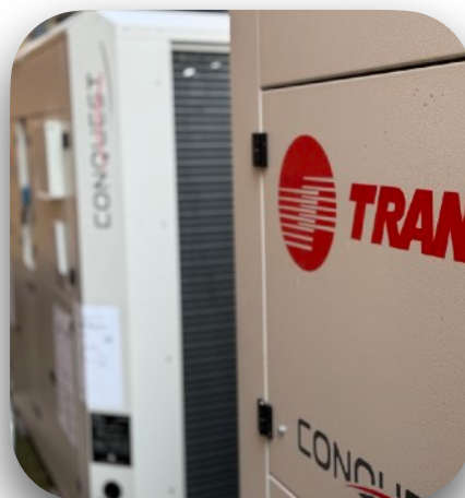
Industrial air source heat pumps.

Ambition: to deliver these new housing projects effectively and efficiently and deliver more waves in the future.